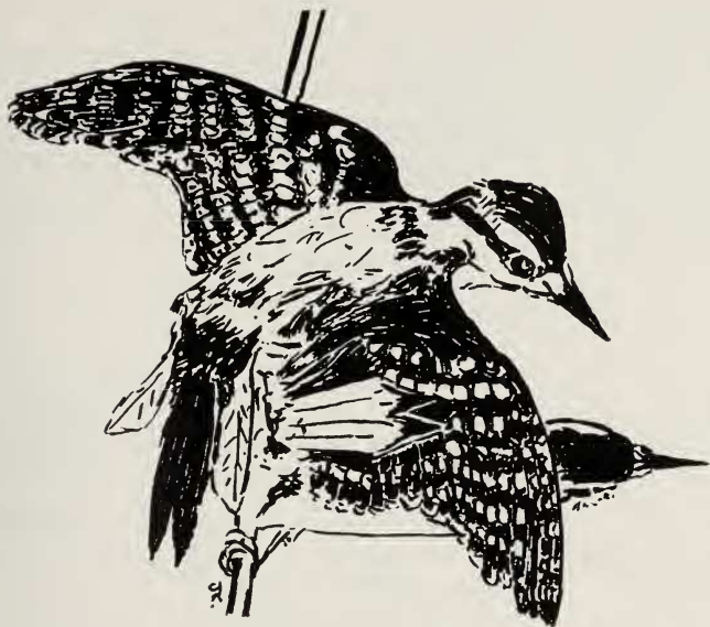
FIG. 1. Hairy Woodpeckers (male above) in full copulation.

peckers in relation to the time of their use or occurrence within the entire breeding season.